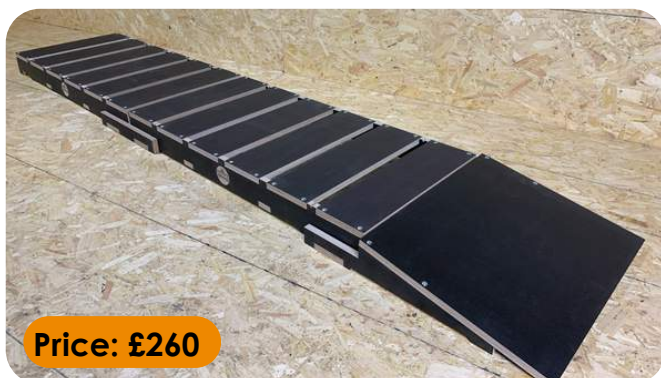
50cm wide with 10cm drop-off