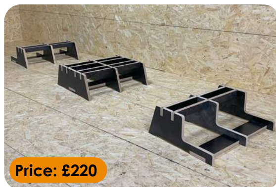
Skinny Riser Kit